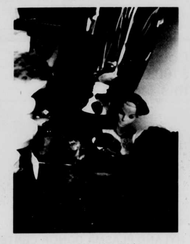
1128 Alder (Near 11th) Regular Hours 11 to 5:30 Closed sundays