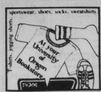
Oregon Daily Emerald

Registration begins at 9 a.m. under the covered tennis courts. and the races will go on as scheduled regardless of the weather. All riders must wear