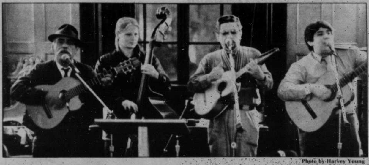
Musical sounds provided by members of a four-piece band were part of the activities Thursday night at the MEChA education conference in Gerlinger Lounge. The conference continues