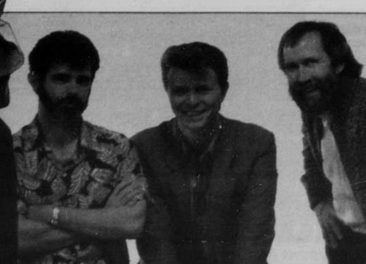
Far Left: Daryl Hannah sitting pretty in Ivan Reitman's new romantic action comedy, Legal Eagles . Left: George Lucas, David Bowie and Jim Henson combine artistic energies in the fantasy adventure, Labyrinth .