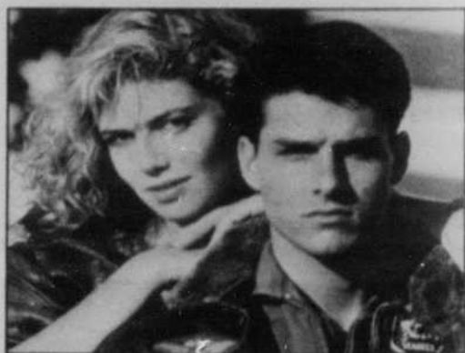
Kelly McGillis ( Witness ) and in-training navy fighter pilot Tom Cruise combine forces in Top Gun . Although Cruise is in a risky business, he gets serious for this flick.

JULY ♦ HEARTBURN —The intriguing star pairing of Meryl Streep and Jack Nicholson would probably make a movie in-