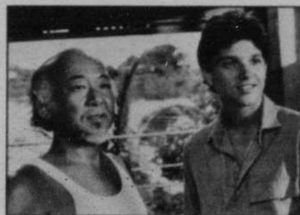
Martial arts men Pat Morita and Ralph Macchio are alive and kicking in Karate Kid II .

MAY 2 ♦ BLUE CITY —This week's brat pack movie stars Judd Nelson as a rebellious kid who returns to his hometown and discovers someone has killed his father. It's up to Judd and his young sister, played by Ally Sheedy, to find the murderers.