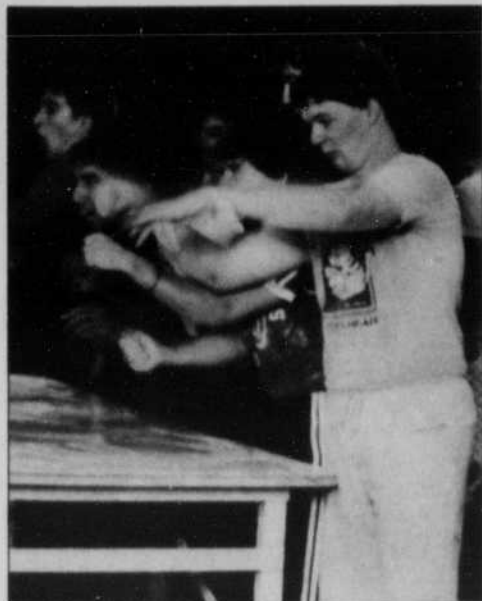
RINGLING BROS. AND BARNUM & BAILEY CLOWN COLLEGE Class clowns: Warming up for acrobatics