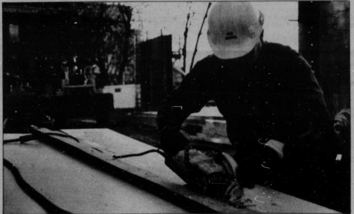
Noisy machinery, which is being used next to Gilbert Hall, is causing many students and faculty with classes in the building to complain.

The next major noise-making step will begin when workers begin cutting into existing buildings to incorporate the structures in a couple of months, Rowe said.