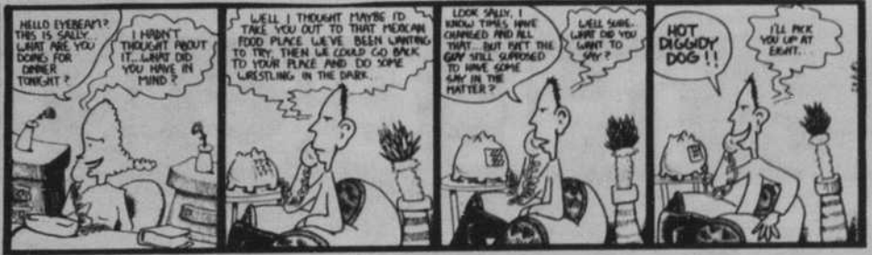
Sally and Eyebeam have found their own private wavelength.

Hurt's books are available in some bookstores or by mail from AAR Tantalus, Inc., P.O. Box 893, Austin, TX 78767 for $4.95 plus 50 cents extra per book for postage and handling.