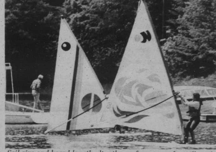
Sail size and board length alter the performance of a sailboard. Short boards move faster than long boards but are more difficult

Story by Kirsten Bolin Photos by Michael Clapp