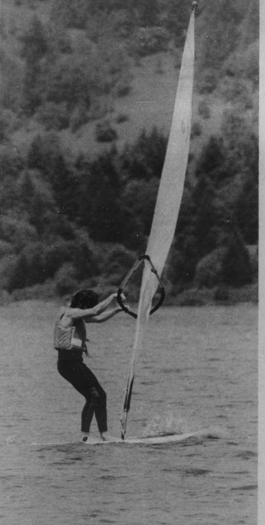
An effortless, graceful glide is the goal of every windsurfer.

APPLICATIONS now being accepted for SPRING and FALL SEMESTERS, 1985