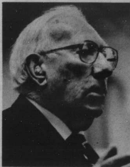
Rep. Claude Pepper

Pepper also talked about Ferraro's commitment to America's elderly. Ferraro, who sits on the House Select Committee on Aging and on Pepper's Health and Long-Term Care subcommittee,