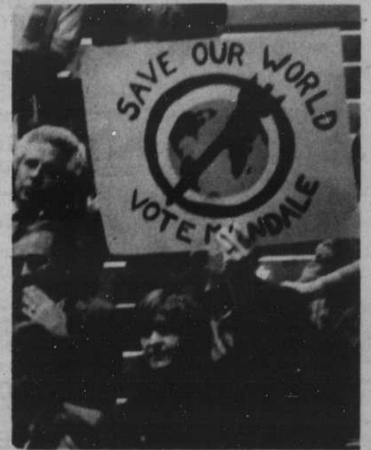
Many of the people turning out to hear Reagan speak in Portland Tuesday demonstrated a political perspective contrary to the president's.

"Since he made a special effort to come here, I should make a special effort to vote for him," he said.