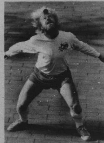
...come into play...

"There are thresholds that come to you and through these thresholds you are drawn in by some magical charm that is very hard to explain. These thresholds are felt by one and all and cannot be missed. Such a feeling."