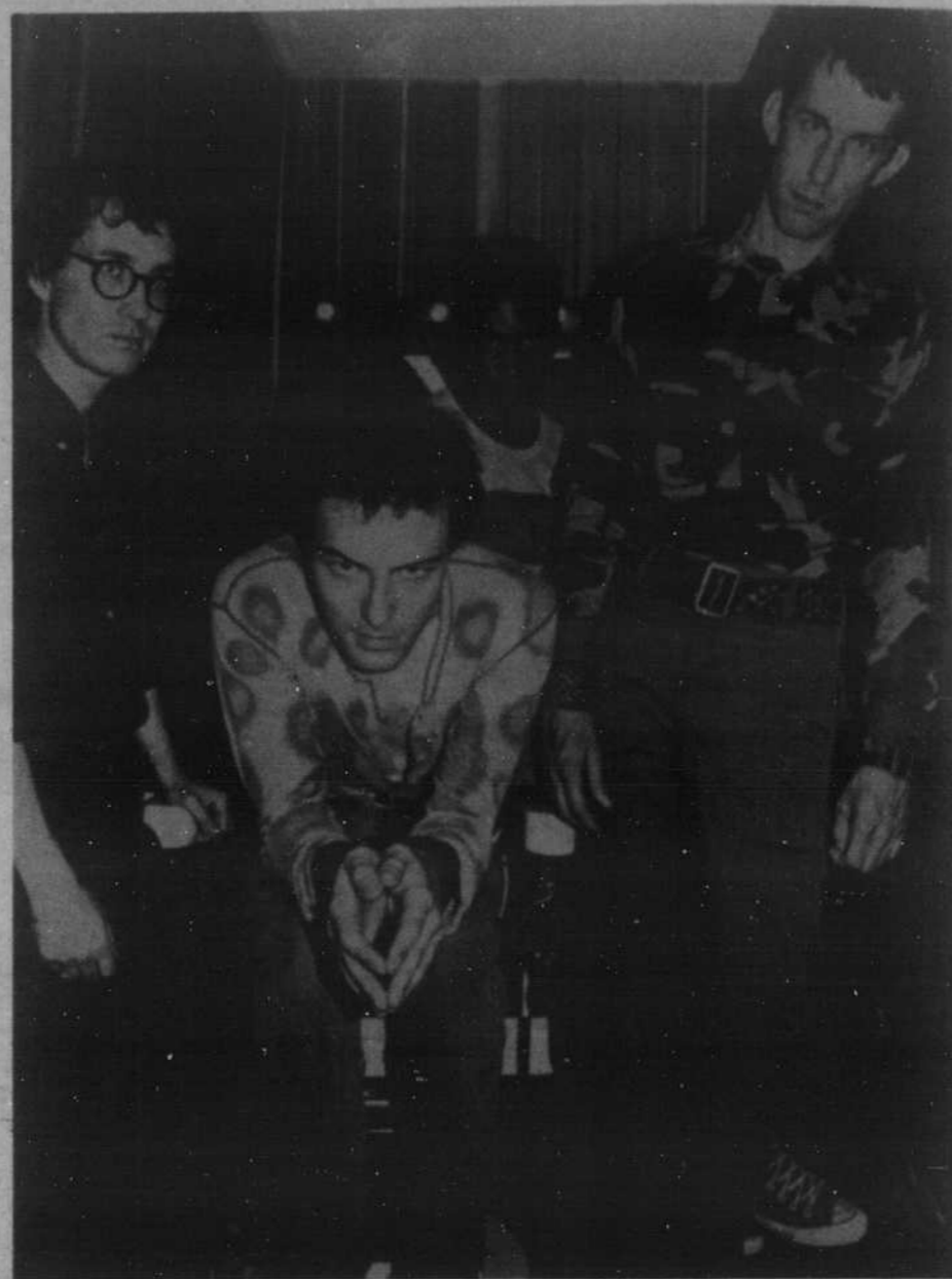
The Dead Kennedys, one of America's top punk rock bands, will perform one show only at Eugene's WOW Hall Wednesday.

The Dead Kennedy's sound is characterized by loud, raw and fast music, spiced with wry political