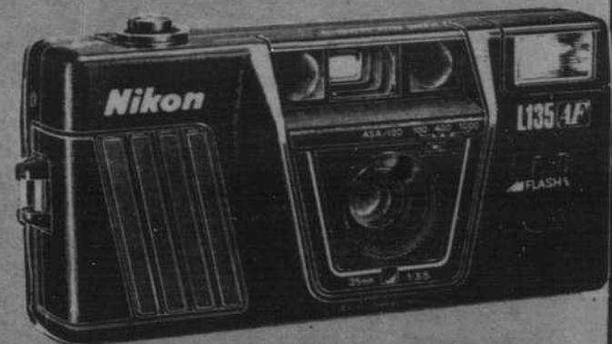
NIKON NICE-TOUCH 135/47