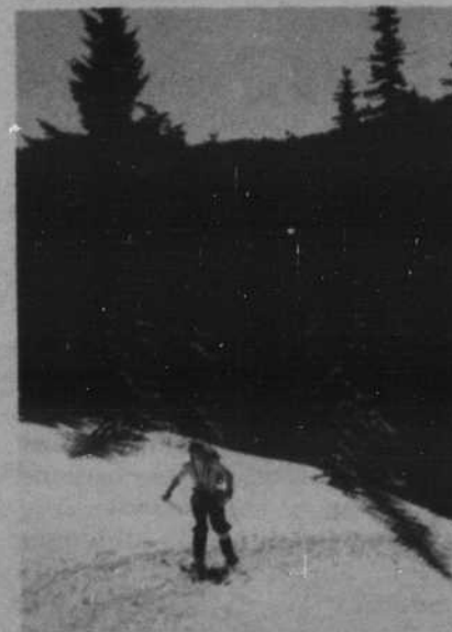
Winter has its blessings. When snow packs the mountains, it's time to dust-off the old skis and hit the slopes.