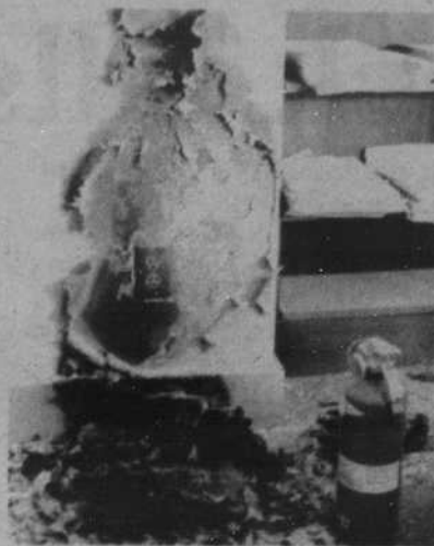
At least $500 worth of damage occurred during a fire at Straub Hall last Friday.