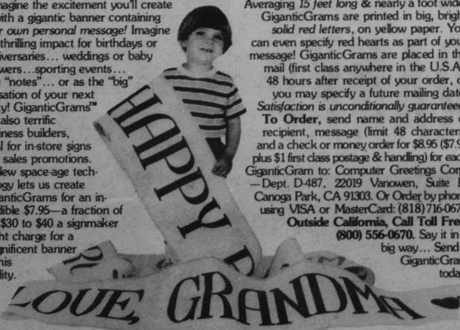
Actual unretouched photograph

Averaging 15 feet long & nearly a foot wide, GiganticGrams are printed in big, bright solid red letters, on yellow paper. You can even specify red hearts as part of your message! GiganticGrams are placed in the mail (first class anywhere in the U.S.A.) 48 hours after receipt of your order, or you may specify a future mailing date. Satisfaction is unconditionally guaranteed. To Order , send name and address of recipient, message (limit 48 characters) and a check or money order for $8.95 ($7.95 plus $1 first class postage & handling) for each GiganticGram to: Computer Greetings Corp. —Dept. D-487, 22019 Vanowen, Suite K, Canoga Park, CA 91303. Or Order by phone using VISA or MasterCard: (818) 716-0670. Outside California, Call Toll Free: (800) 556-0670. Say it in a big way... Send a GiganticGram today!