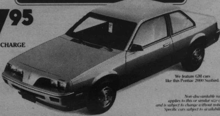
We feature GM cars like this Pontiac 2000 Sunbird.

Rate available from noon Thursday to noon Monday. Certain daily minimums apply. Ask for details.