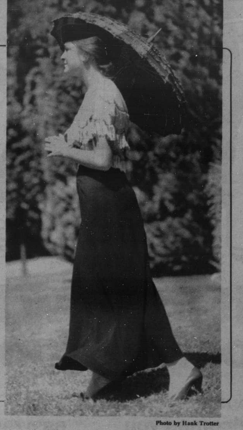
A twirl of the parasol and a garment designed for

"It's nice to come into a place and find just one piece, not a whole rack with 15 or 20 of one thing all in the same size," said Rosa. "Here you find just one of a kind.