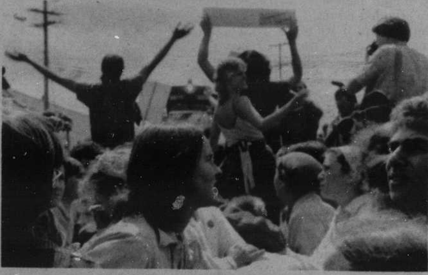
Although many protesters were arrested, the conflict was more spiritual than physical at the organized blocking of the White Train last month in Vancouver, Wash.

of consciousness in people — people who never knew that this train existed, much less that it traveled through their backyards. It has been running from the Pantex plant in Amarillo, Texas to the Trident Submarine base in Bangor, Wash.