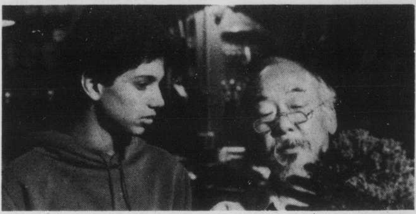
Noriyuki "Pat" Morita teaches Ralph Macchio that true karate involves more than kicks, jabs and chops in Columbia Pictures' "The Karate Kid."

Saddled with an atrocious title, "The Karate Kid" comes under ridicule from people who have never seen it for aspects they assume are in the film. This isn't a Chuck Norris action film; it is the story of a relation-