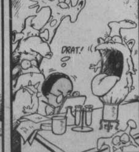
Section A, Page 7