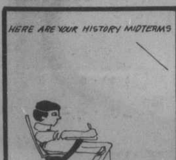
Oregon Daily Emerald