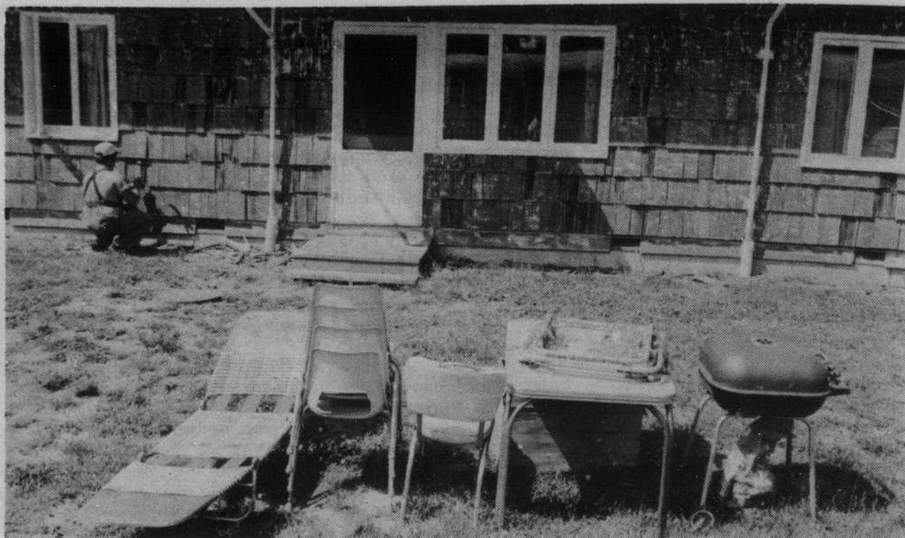
Emerald Photo University Housing — like this family unit — offers low rent and community living to students who are married or single parents.