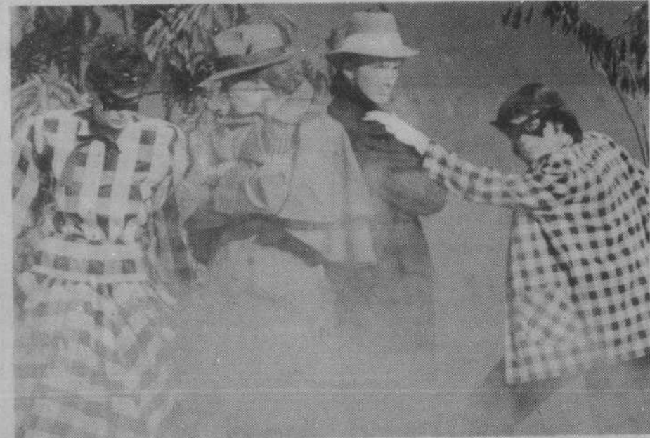
"Nights on Broadway," a fashion show held at the Hult Center last Thursday, included song, dance, a fog machine and the latest word in clothes.

All in all, "Nights on Broadway," Eugene's toast to fashion, was an excellent production set in the finest of atmospheres.