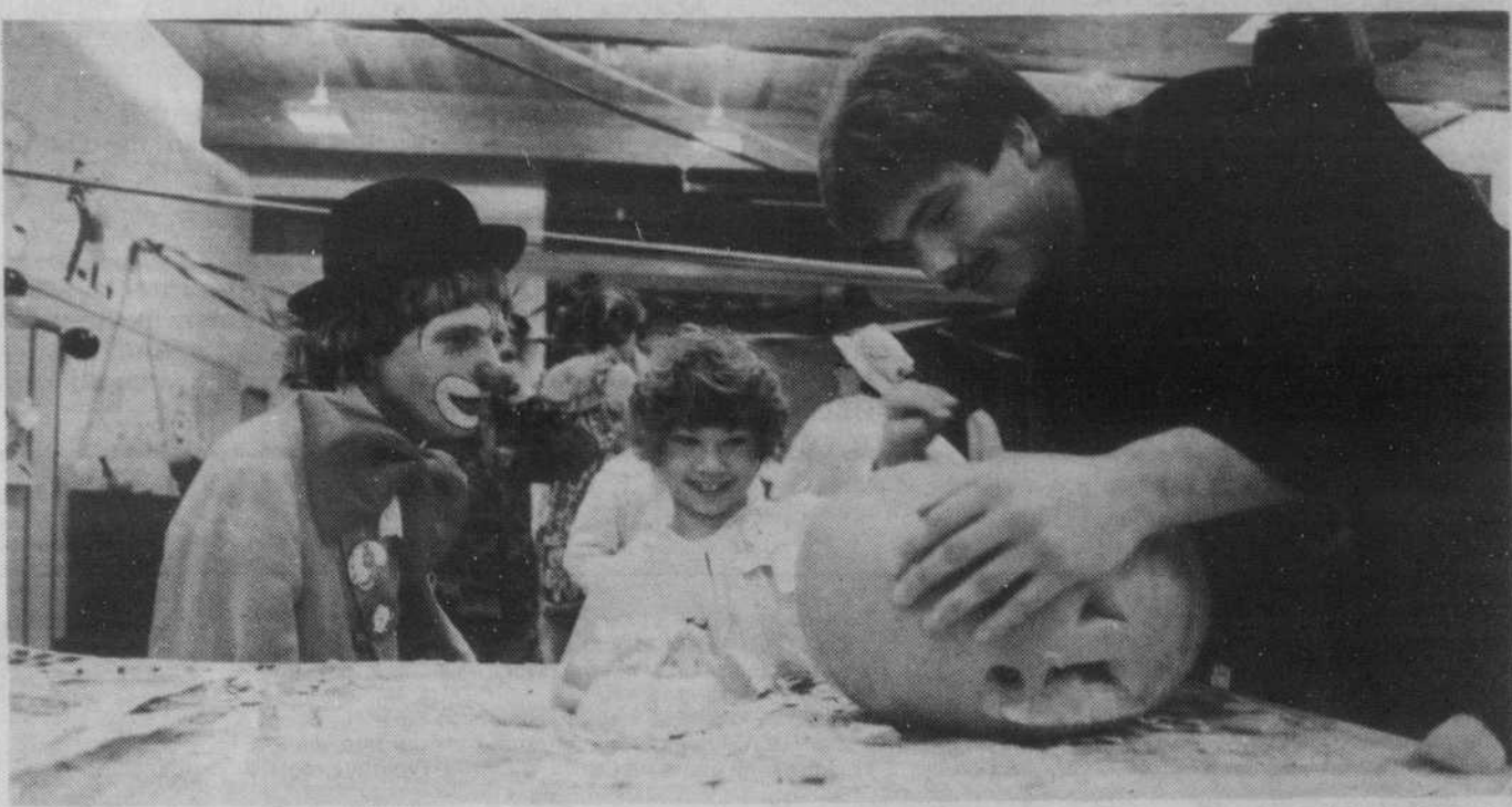
Special education children get the chance to carve pumpkins at a party sponsored by a fraternity

Peterson already is excited for next year's party.