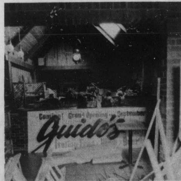
Under construction, the old Duffy's is becoming the new Guido's.