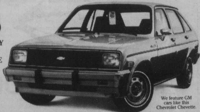
We feature GM cars like this Chevrolet Chevette.

UNLIMITED FREE MILEAGE Rate available from noon Thursday to noon Monday. Certain daily minimums apply. Ask for details.