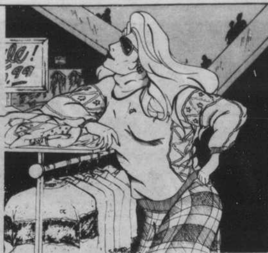
Graphic by Shawn Bird

The sweater, fortunately, is a versatile and practical piece of clothing. It can go over shirts, under them, over more sweaters, under nothing.