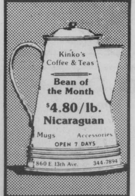
Oregon Daily Emerald

An Original Play at Sheli's Sat. & Sun. pm. Two strangers learn to live tih their fear of each other. 8-11