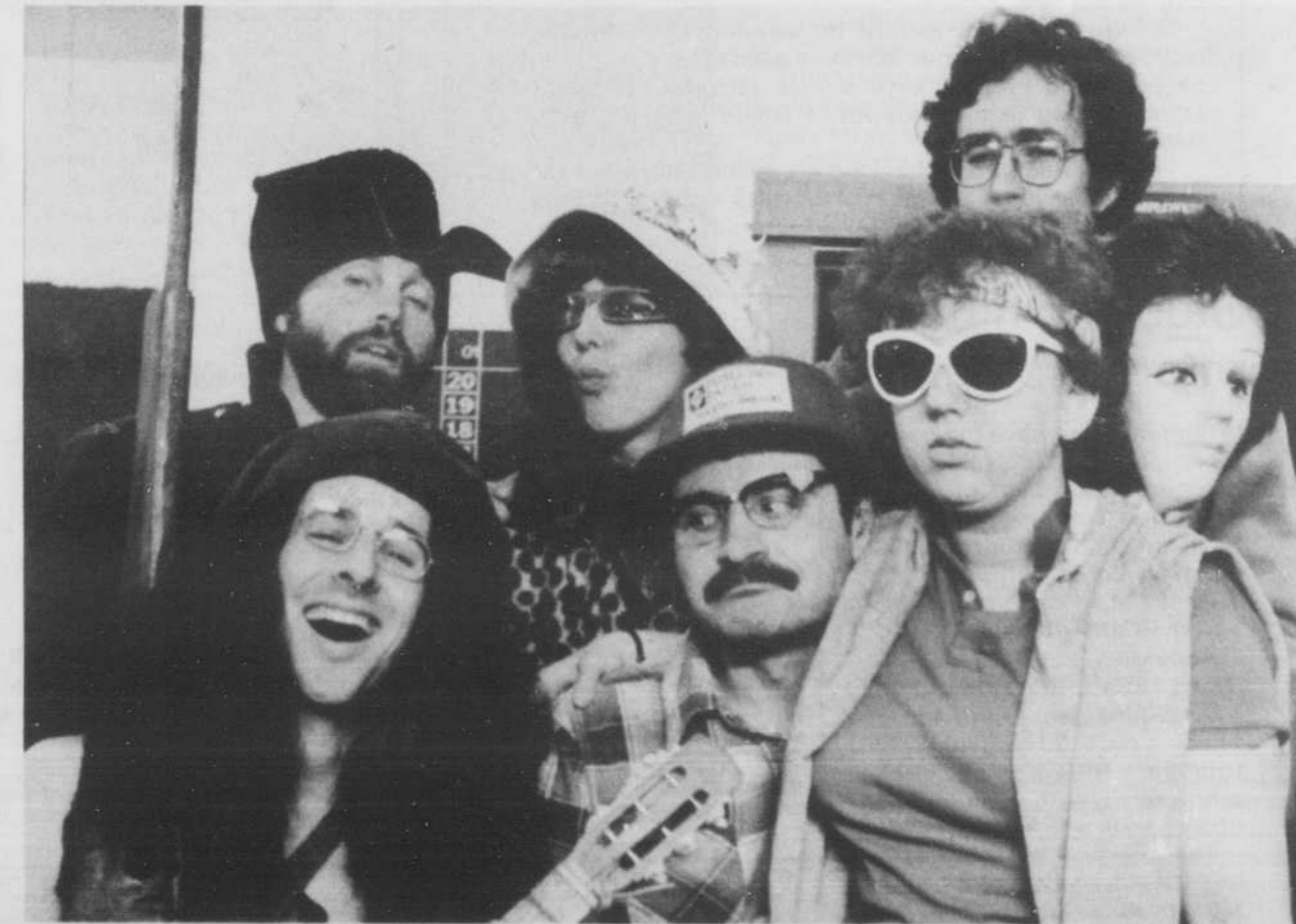
The cast of "On the Edge" presents outrageous comedy, music and improvisations at the Brass Rail, 4th and Willamette. Tickets are $2 and shows are Dec. 3, 4, 10, 11, 17 and 18.

Expires December 24, 1982 Limit one coupon per item, please