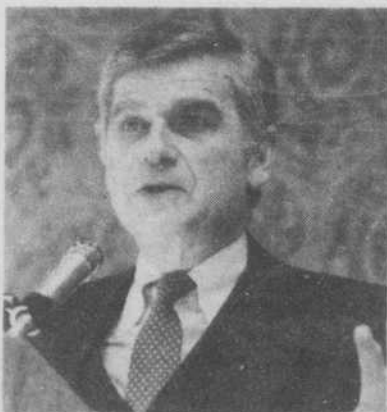
Sen. Mark Hatfield

The rural ratepayers were charged more because they are served by private utilities, while city-dwellers were charged the lower rates of public utilities and co-ops, Hatfield said.