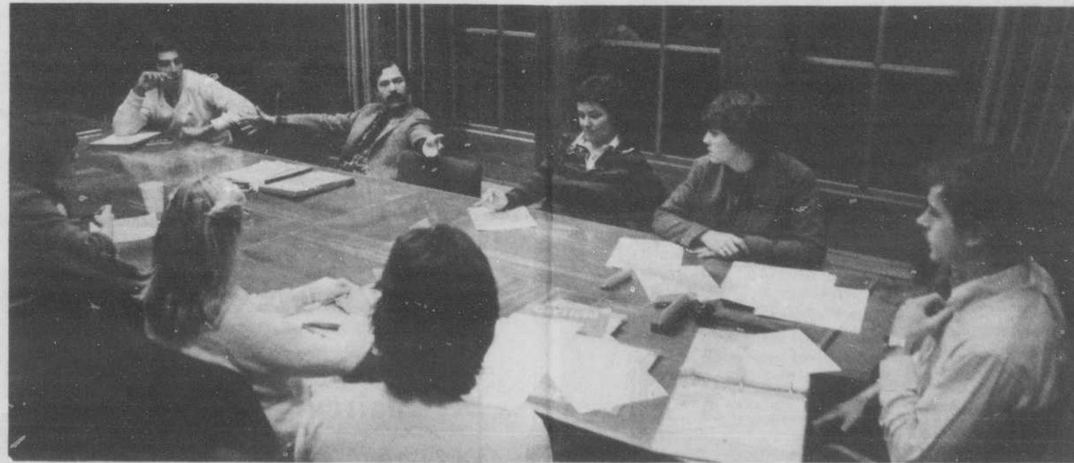
The IFC is trying to limit the number of programs requesting funds.