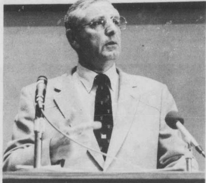
Gov. Vic Atiyeh

Kulongoski also suggests investing employers' pension funds to generate revenue, a plan he says has been successful in other states.