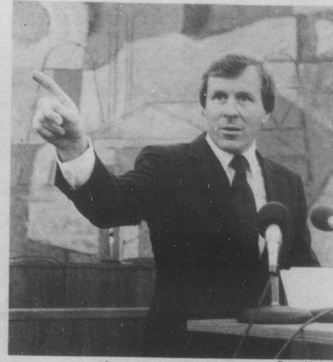
Democrat Ted Kulongoski

Atiyeh says this accusation and ones like it are not true, and that nobody expected the projections until December because that is how the quarterly system runs. Kulongoski and Atiyeh both call for abolishment of the insanity plea, but differ on capital punishment. Atiyeh says an enforceable death penalty would be acceptable while Kulongoski says "capital punishment is punishment for those people without capital" and has no deterrent effect. Both candidates claim to be supporters