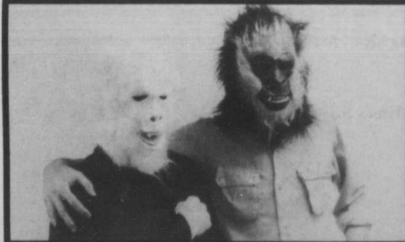
"Werewolf" Masks $14.95 each