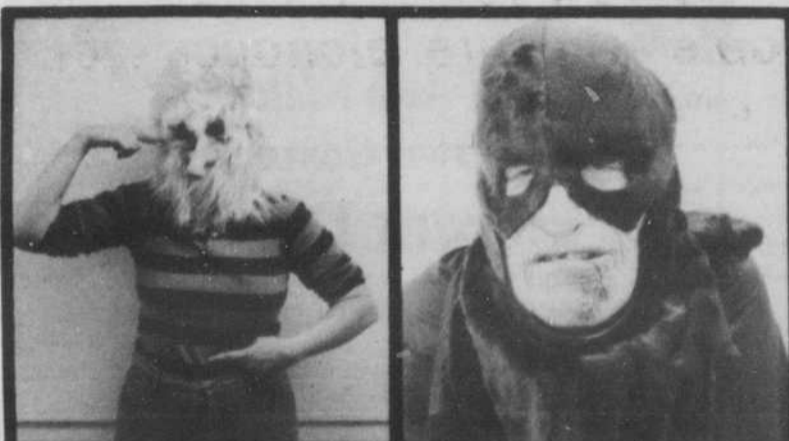
"It" Mask $8.49