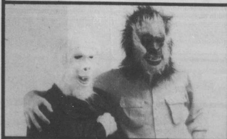
"Werewolf" Masks $14.95 each