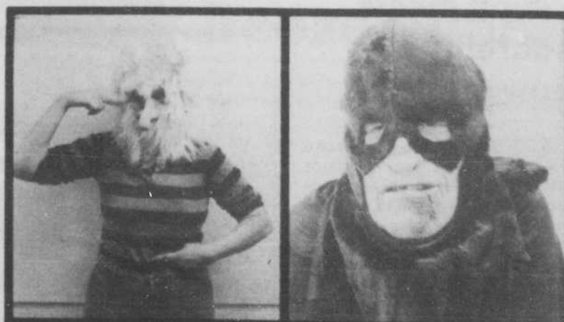
"It" Mask $8.49

Textbooks 686-3520 • General Books 686-3510 • Supplies 686-4331