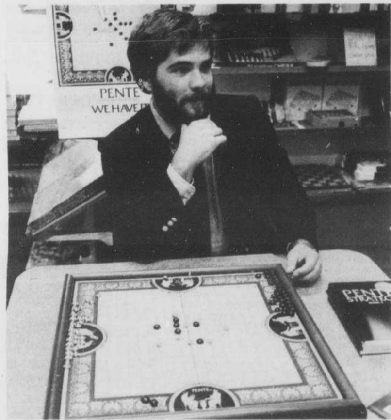
Based on the ancient oriental game of GO, game sellers predict Pente, the newest in "gorgeous games," will corner the market.

Braunlich, now 24, says his first book sold 100,000 copies.