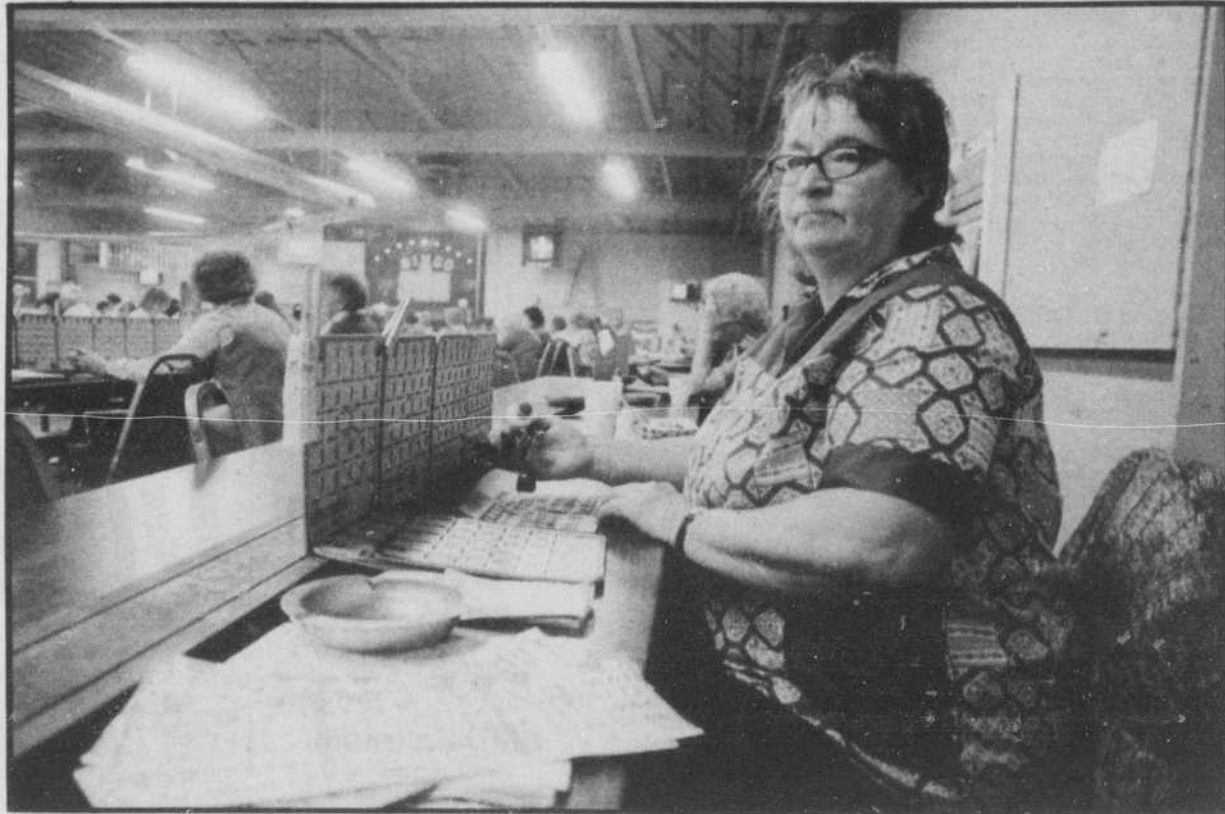
Top right photo: A man crosses his fingers in anticipation of a winning number. Above: This woman won $40 on one of her three cards, the first time she's won this month. Bottom left: Filling in the right blanks is the way to win, which is what this woman, bottom center, has done. Bottom right: A woman calls out the bingo numbers.

Open four nights a week since last Aug. 1, ARC Bingo is across