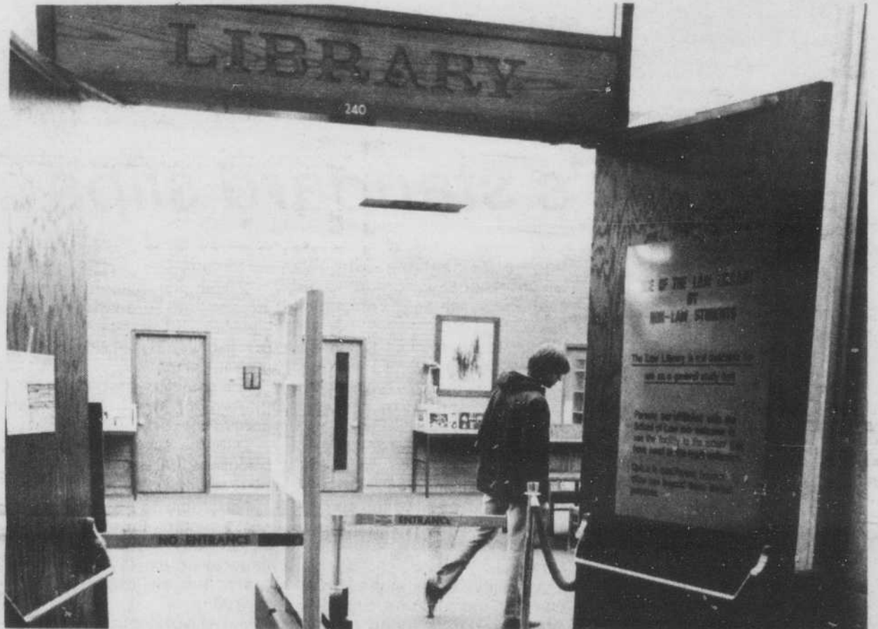
The Kenneth Lucas Fenton Memorial Law Library contains over 115,000 volumes and 650 legal journals on Oregon law.

Store Hours: Mon.-Sat., 10:00-6:00 537 Willamette • Eugene, OR 97401 • 342-1298