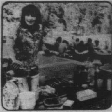
The West University Neighbors 1458 Ferry St. • Eugene, Ore. 97401 • 687-5386