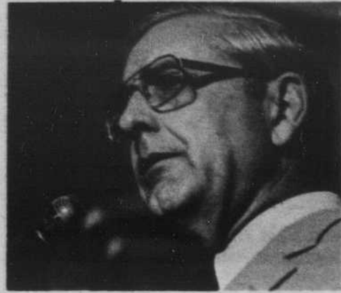
Gov. Vic Atiyeh