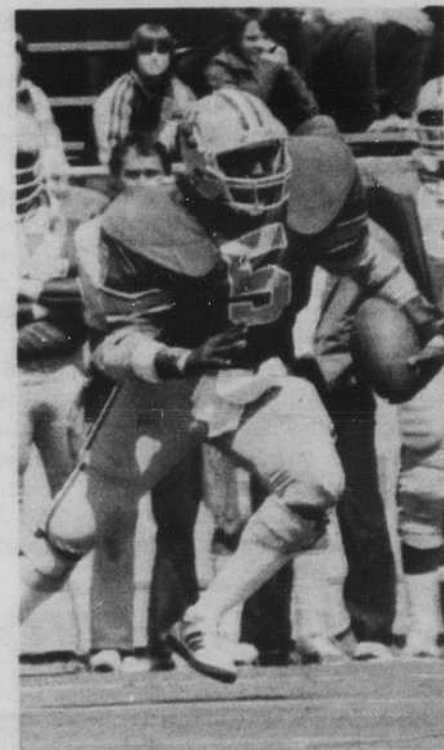
. . . and then back that-a-way . . .