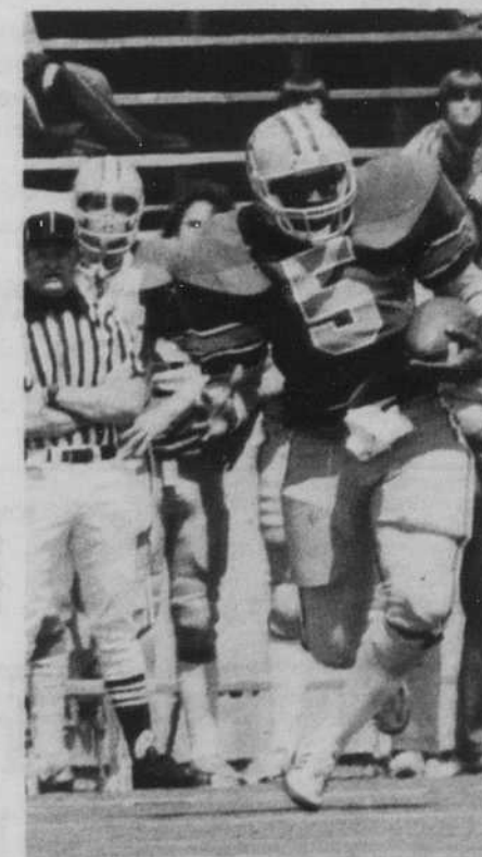
. . . on his way to a 37-yard burst.