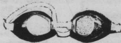
Speedo Swim Goggles