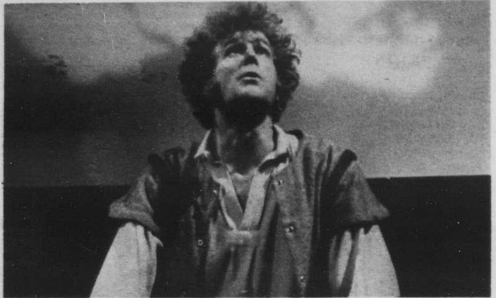
Henrik Ibsen's play "Peer Gynt" will be presented tonight and Saturday at the Pocket Playhouse.

Tonight - Mason-Dixon Feb. 26 - 27 - Cowboys Feb. 28 - Wheatfield