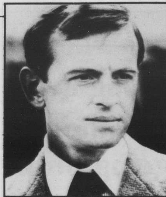
Ian Charleson is magnificent as a Scottish missionary who becomes an Olympic runner in "Chariots of Fire."

At no point does this become more apparent than in the final scene, in which Liddell races for victory against a field of the best runners in the world. The audience runs each step of the race with him, feels the knives of pain when the runner can't get enough air, and feels the "joy of God" rushing through the athlete's body as he nears the tape.