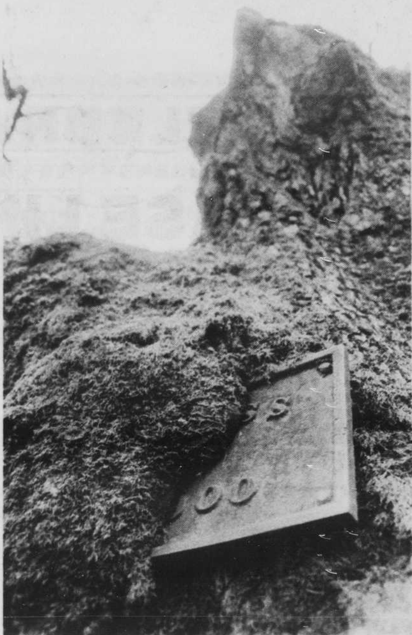
The class of 1900 left two oak trees — one with a plaque attached — as a gift to the University.

Some gifts have withstood the test of time. The gates at Howe Field have outlived many of the donors from 1919, as well as the