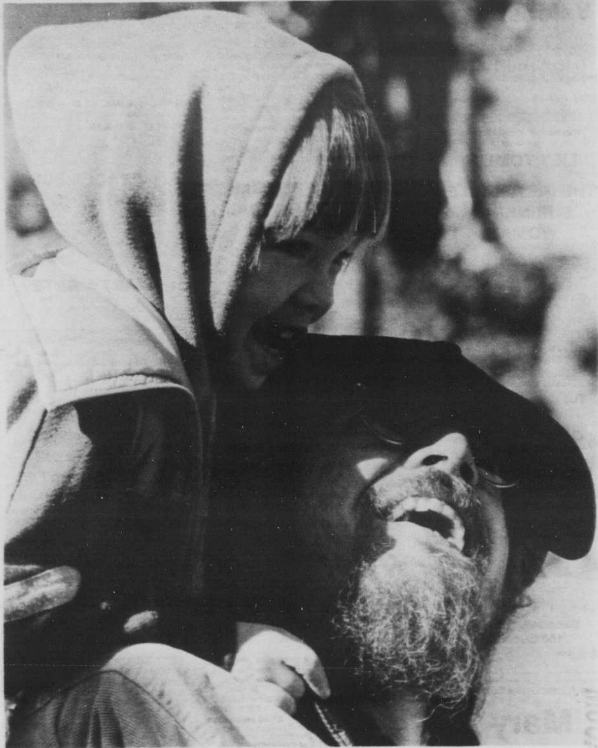
A crowd of more than 200 people gathered in the EMU courtyard Tuesday at noon to watch a performance of "The World's Smallest Circus." Eugene is the only Willamette Valley stop on the group's 32,000 mile tour, which covers 40 states.