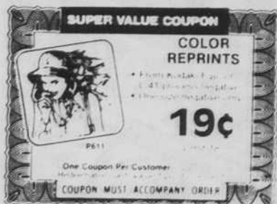
Photo offer expires 2/13/82

One Day Film Developing Service C-41 Only