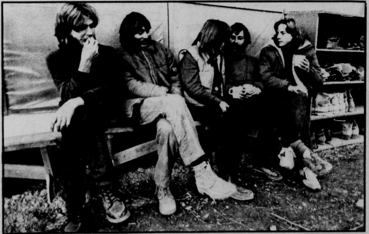
Commune members take a break from the difficult task of building a city from scratch.