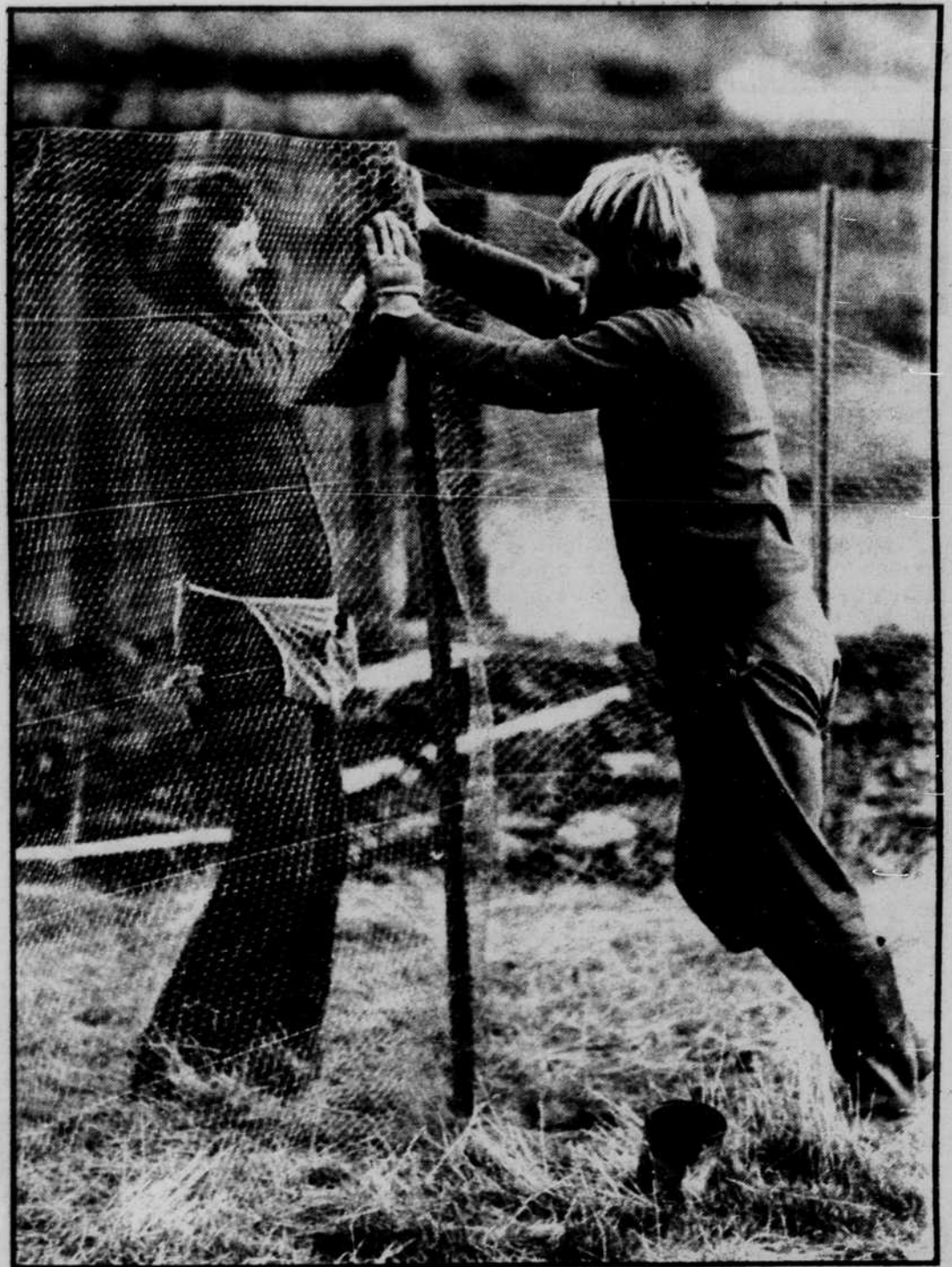
Two followers of the 49-year-old guru, Rajneesh, work to erect a fence. Members get one day off per month which they often spend working.

A few farm-style houses and buildings originally on the ranch remain, but the rest of the place has been altered considerably. Cafeterias and other facilities are being raised quickly from the ground as crews work 12-14 hours per day, seven days a week.