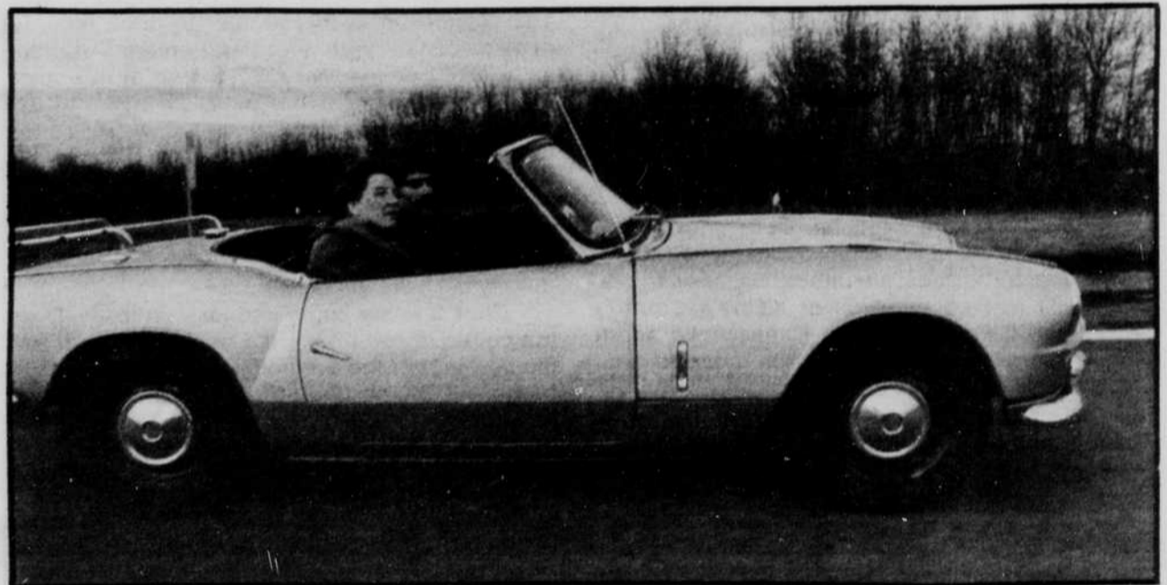
While it's not impossible to have a great medium-priced evening in Eugene, it's sometimes easier to try different climes. A quick drive is fairly cheap, fun, and much more interesting than watching "Airport '79" again.