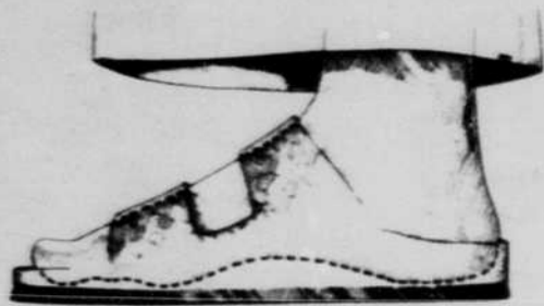
Lightweight, flexible cork footbed forms to your foot

Toe grip gives toes beneficial exercise. Naturally designed arch supports your foot. Molded heelcup for balance.