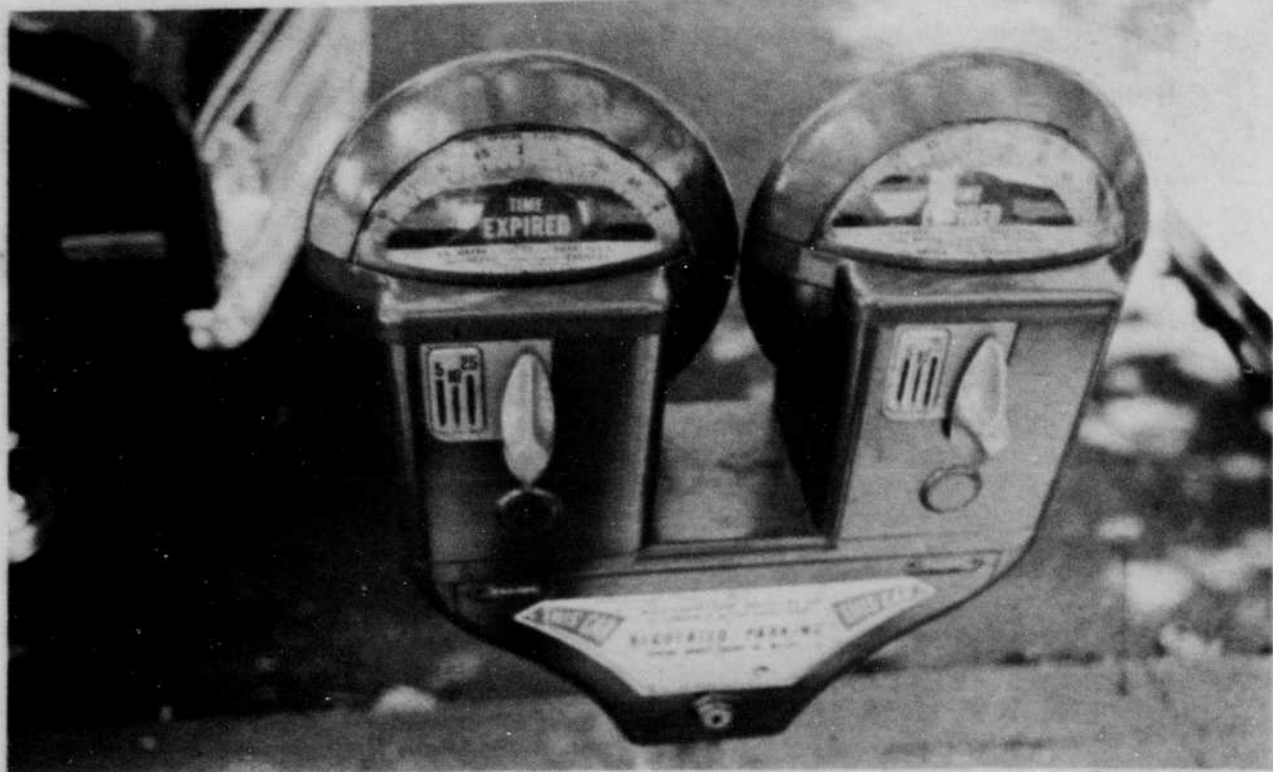
Campus security diligently tickets drivers who overstay their time at one of the University's 300 parking meters.